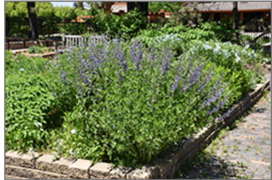
Blue Wild Indigo flowers

This plant does best in full sun to partial shade. It is very adaptable to both dry and moist growing conditions, but will not tolerate any standing water. It is considered to be drought-tolerant, and thus makes an ideal choice for a low-water garden or xeriscape application. It is not particular as to soil type, but has a definite preference for alkaline soils, and is able to handle environmental salt. It is somewhat tolerant of urban pollution. This species is native to parts of North America.