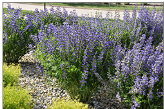
Blue Wild Indigo in bloom