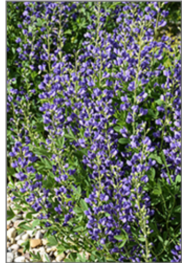
Blue Wild Indigo flowers

This is a relatively low maintenance plant, and is best cleaned up in early spring before it resumes active growth for the season. It is a good choice for attracting bees and butterflies to your yard. It has no significant negative characteristics.