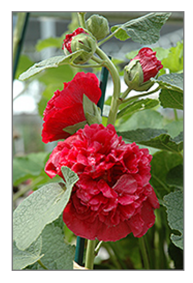
Powderpuff Red Hollyhock flowers

Giant double red flowers on towering spikes, this biennial is tolerant to the natural toxin formed by the roots of Black Walnut, but can be susceptible to Japanese beetles; plant in full sun for better growth