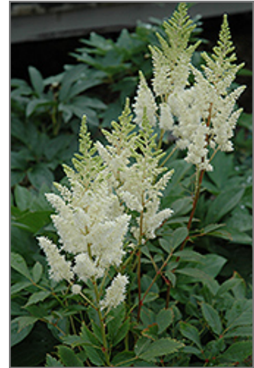
White Gloria Astilbe flowers