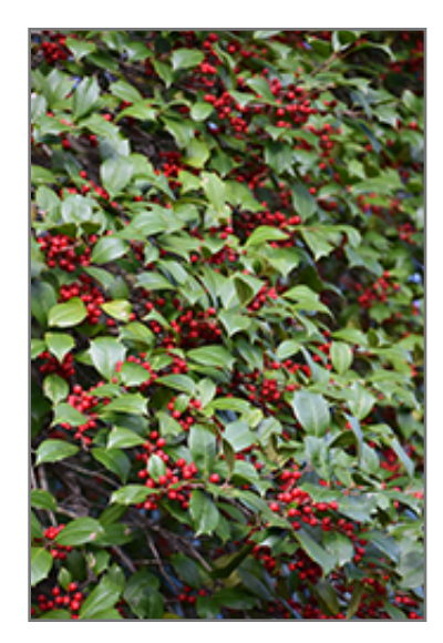
American Holly fruit