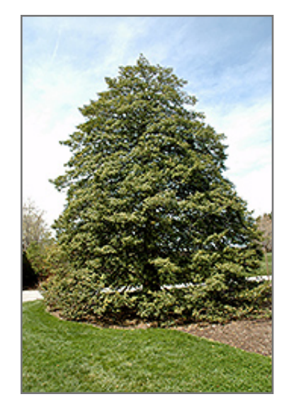
American Holly