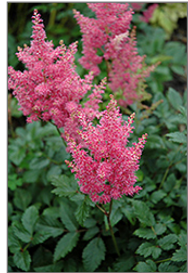
Rheinland Astilbe flowers

Rheinland Astilbe is recommended for the following landscape applications;