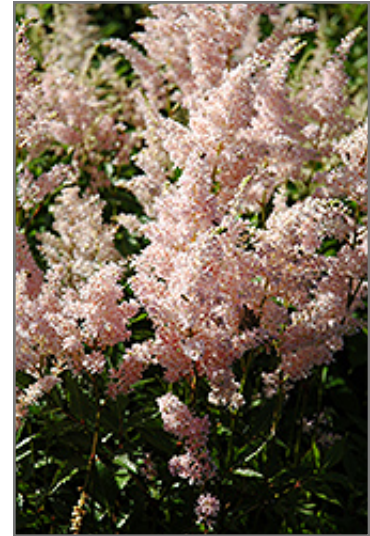
Europa Astilbe flowers