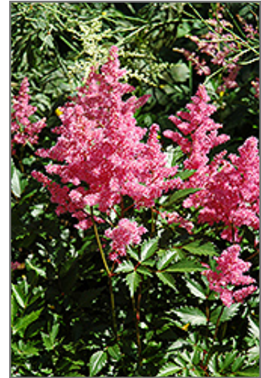
Bremen Astilbe flowers