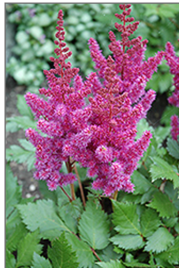
Visions Astilbe flowers