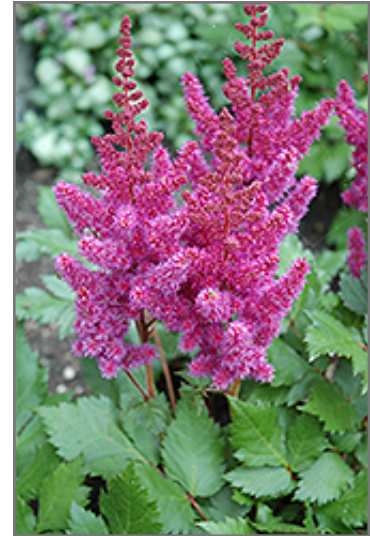
Visions Astilbe flowers