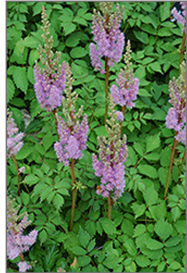
Dwarf Chinese Astilbe flowers

Dwarf Chinese Astilbe is recommended for the following landscape applications;