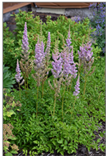
Dwarf Chinese Astilbe in bloom