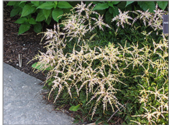
Sprite Astilbe in bloom