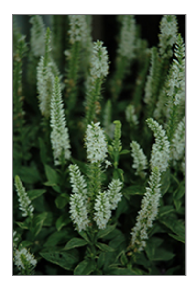
Charlotte Speedwell flowers

A compact selection, great for borders, containers, and rock gardens; numerous spikes of brilliant white flowers starting in early summer; prune spent blooms to encourage re-blooming