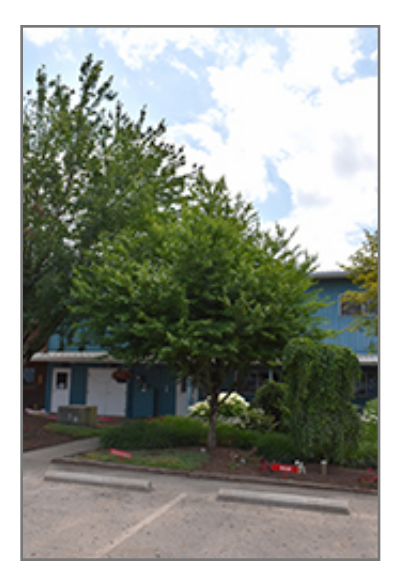
Snow Charm Japanese Snowbell