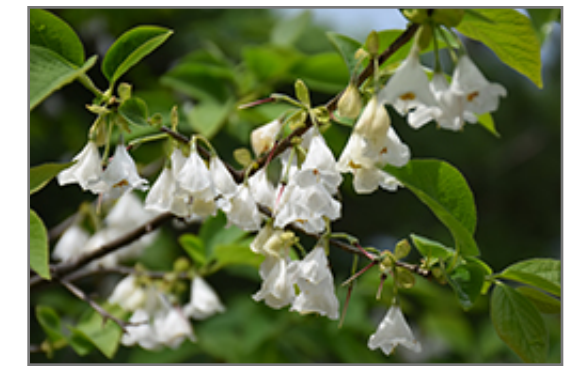
Snow Charm Japanese Snowbell flowers

This tree will require occasional maintenance and upkeep, and should only be pruned after flowering to avoid removing any of the current season's flowers. Gardeners should be aware of the following characteristic(s) that may warrant special consideration;