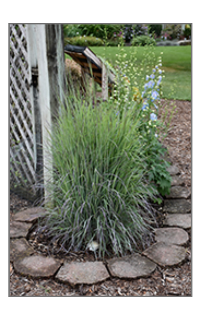
Twilight Zone Bluestem

Twilight Zone Bluestem's attractive grassy leaves are green in colour with showy silvery blue variegation and tinges of purple on a plant with an upright spreading habit of growth. As an added bonus, the foliage turns a gorgeous violet in the fall. It has masses of beautiful spikes of purple flowers rising above the foliage in late summer, which are most effective when planted in groupings.