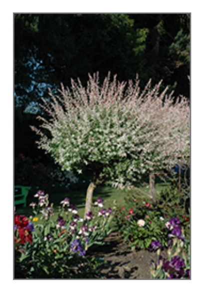
Tricolor Willow (tree form)

Tricolor Willow (tree form) is a fine choice for the yard, but it is also a good selection for planting in outdoor pots and containers. With its upright habit of growth, it is best suited for use as a 'thriller' in the 'spiller-thriller-filler' container combination; plant it near the center of the pot, surrounded by smaller plants and those that spill over the edges. It is even sizeable enough that it can be grown alone in a suitable container. Note that when grown in a container, it may not perform exactly as indicated on the tag - this is to be expected. Also note that when growing plants in outdoor containers and baskets, they may require more frequent waterings than they would in the yard or garden. Be aware that in our climate, most plants cannot be expected to survive the winter if left in containers outdoors, and this plant is no exception. Contact our experts for more information on how to protect it over the winter months.