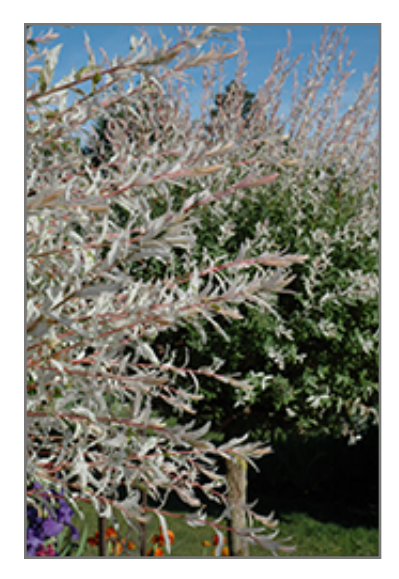
Tricolor Willow (tree form) foliage