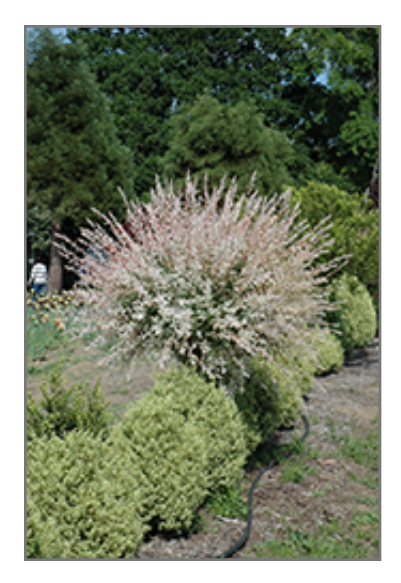
Tricolor Willow (tree form) in spring