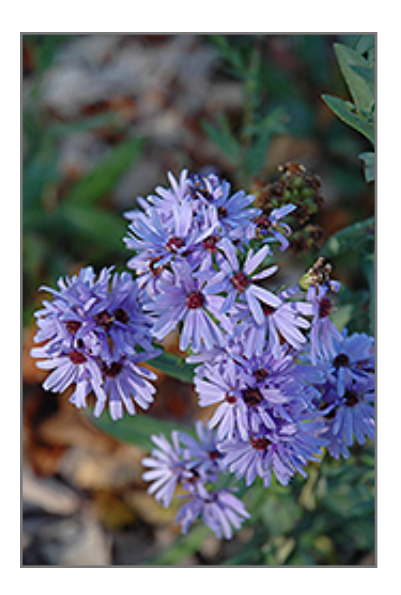
Smooth Aster flowers