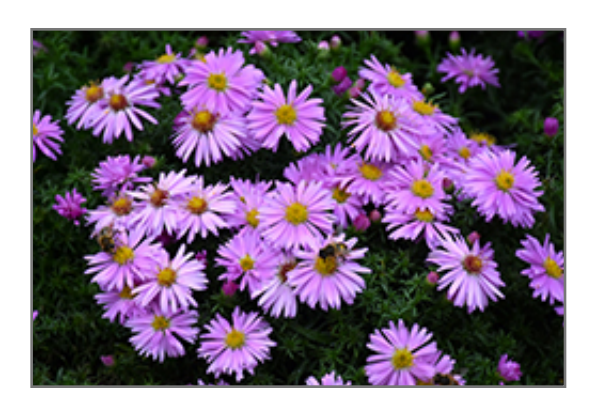
Woods Pink Aster flowers

Mounds of narrow, dark green foliage are covered with pink daisy-like flowers, adding a pop of color to autumn days; dwarf compact habit, ideal for patio containers, borders or garden beds; beautiful added to fresh cut arrangements; low maintenance