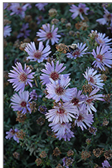
Woods Blue Aster flowers