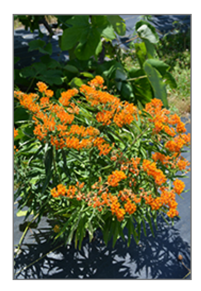
Butterfly Weed in bloom