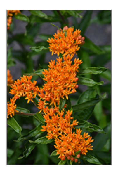
Butterfly Weed flowers