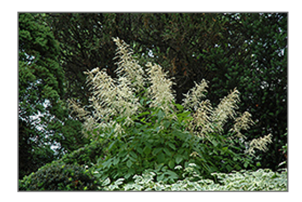
Goatsbeard in bloom

Goatsbeard is recommended for the following landscape applications;