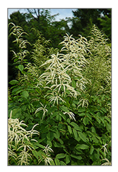
Goatsbeard flowers

This is a relatively low maintenance plant, and is best cleaned up in early spring before it resumes active growth for the season. Deer don't particularly care for this plant and will usually leave it alone in favor of tastier treats. It has no significant negative characteristics.