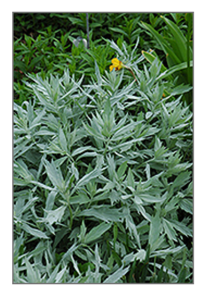
Valerie Finnis Artemisia foliage

Valerie Finnis Artemisia is recommended for the following landscape applications;