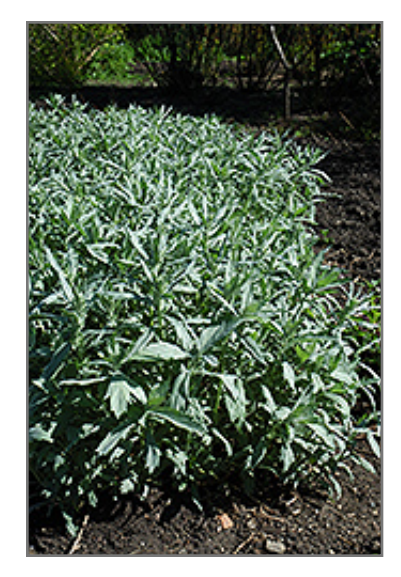
Valerie Finnis Artemisia