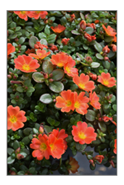
Mojave Tangerine Portulaca flowers