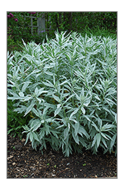
White Mugwort