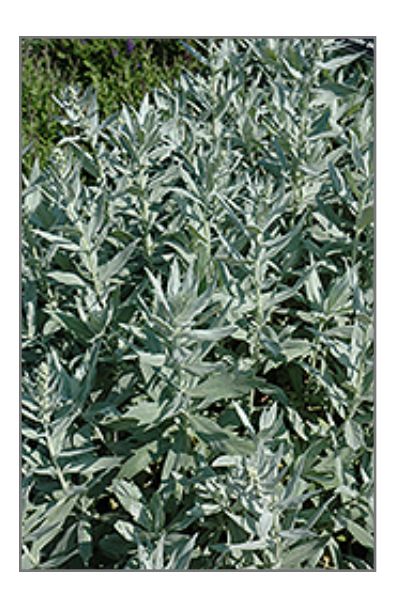
White Mugwort foliage