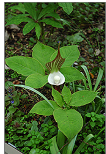
Japanese Jack-In-The-Pulpit in bloom