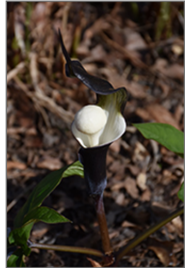
Japanese Jack-In-The-Pulpit flowers