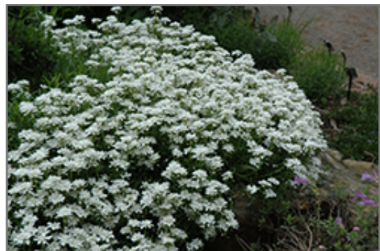
Candytuft in bloom