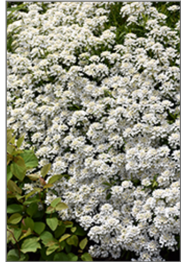
Candytuft in bloom