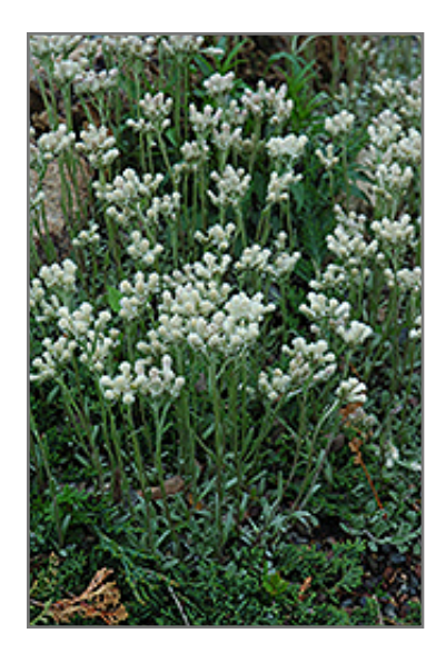
Pussytoes in bloom