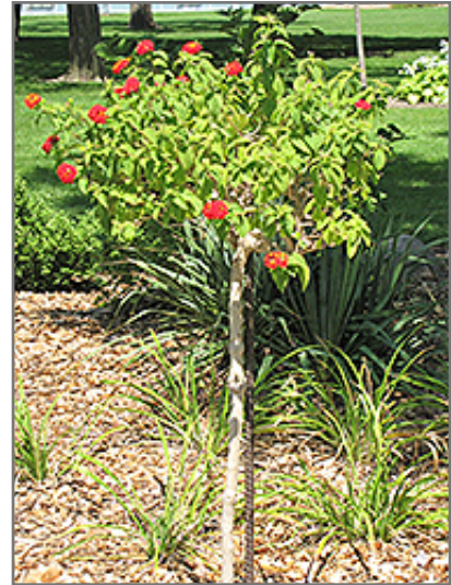
Luscious Citrus Blend Lantana (tree form) in bloom