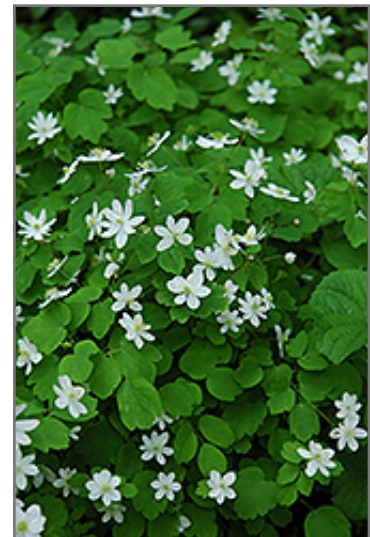
Rue Anemone flowers