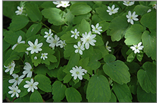
Rue Anemone flowers