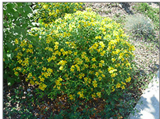
Kalm's St. John's Wort in bloom