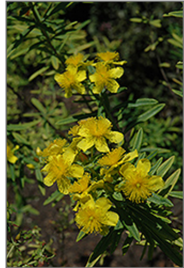
Kalm's St. John's Wort flowers