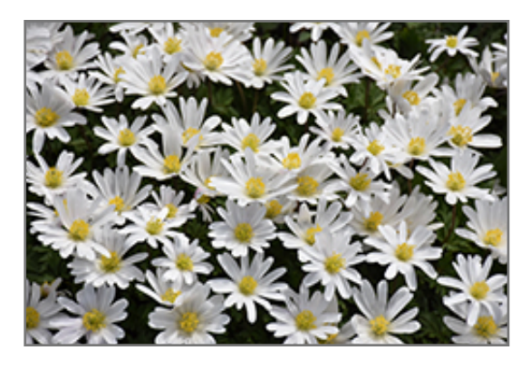
White Splendor Windflower flowers