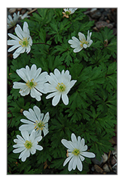
White Splendor Windflower flowers