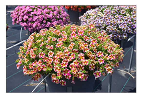
Superbells Holy Moly! Calibrachoa in bloom

This plant will require occasional maintenance and upkeep. Trim off the flower heads after they fade and die to encourage more blooms late into the season. It is a good choice for attracting bees and hummingbirds to your yard, but is not particularly attractive to deer who tend to leave it alone in favor of tastier treats. It has no significant negative characteristics.