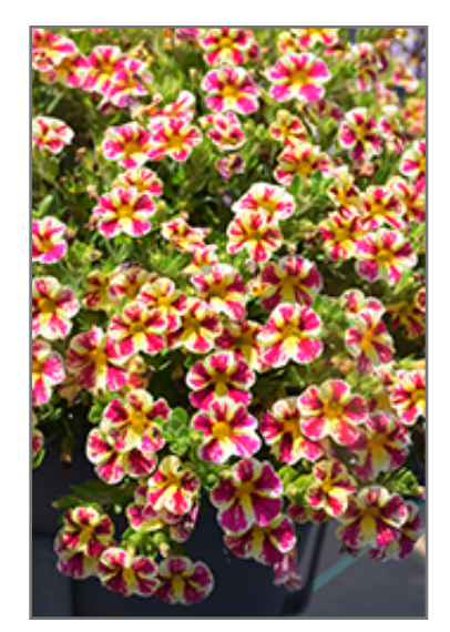
Superbells Holy Moly! Calibrachoa flowers

Superbells Holy Moly! Calibrachoa is a dense herbaceous annual with a trailing habit of growth, eventually spilling over the edges of hanging baskets and containers. Its medium texture blends into the garden, but can always be balanced by a couple of finer or coarser plants for an effective composition.