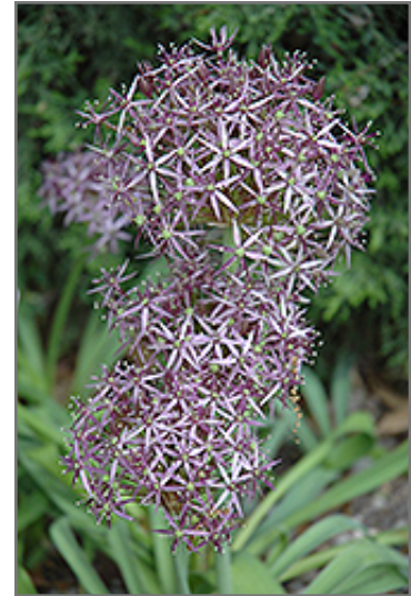
Star Of Persia Onion flowers