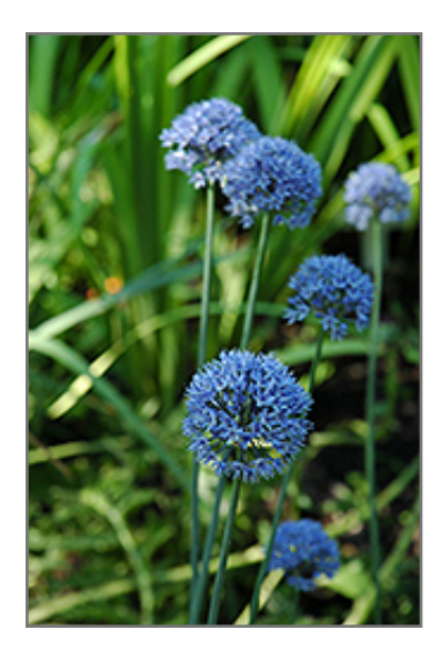
Blue Drumstick Ornamental Onion flowers

Long sturdy stems with egg shaped flowers stand out in early summer; fragrant blue blooms rise above mounded green foliage, ideal for containers, beds, borders or used in fresh cut arrangements; summer dormant and low maintenance