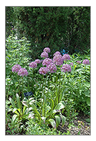
Globernaster Ornamental Onion in bloom