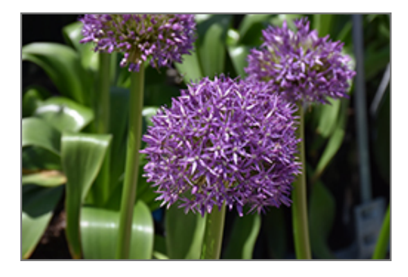
Globemaster Ornamental Onion flowers

This is a relatively low maintenance plant, and should only be pruned after flowering to avoid removing any of the current season's flowers. It is a good choice for attracting butterflies to your yard, but is not particularly attractive to deer who tend to leave it alone in favor of tastier treats. It has no significant negative characteristics.