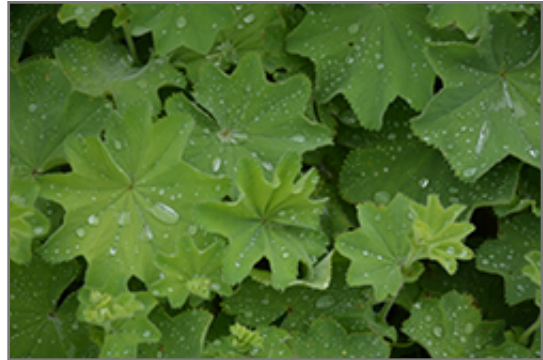
Lady's Mantle foliage

This plant performs well in both full sun and full shade. It is very adaptable to both dry and moist locations, and should do just fine under typical garden conditions. It is not particular as to soil type or pH. It is highly tolerant of urban pollution and will even thrive in inner city environments. This species is not originally from North America. It can be propagated by cuttings.