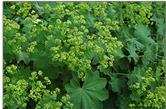
Lady's Mantle flowers

Lady's Mantle is recommended for the following landscape applications;