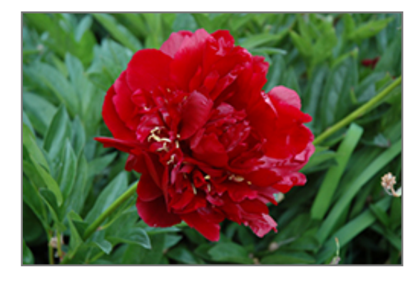
Watermelon Wine Peony flowers