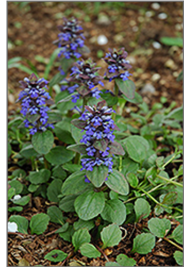
Caitlin's Giant Bugleweed flowers

Caitlin's Giant Bugleweed is recommended for the following landscape applications;