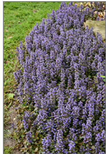
Caitlin's Giant Bugleweed