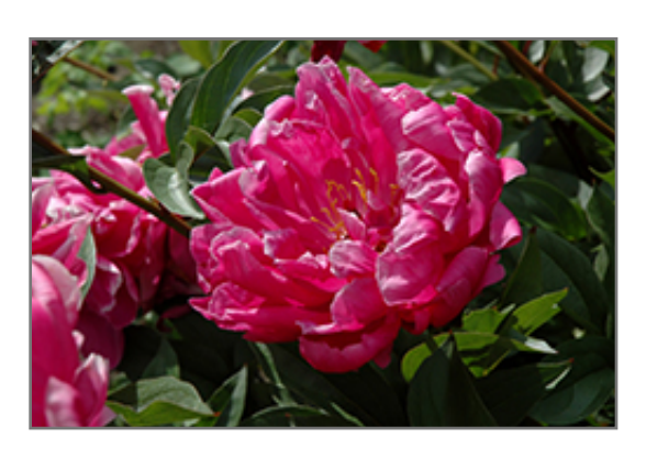
Double Red Peony flowers

This pleasing variety will create a dramatic late spring display in garden and border plantings; rich red, fragrant double blooms open on stiff stems, making them an excellent cut flower