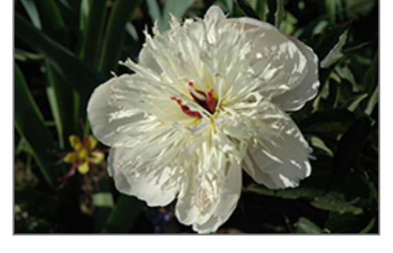
Cream Puff Peony flowers