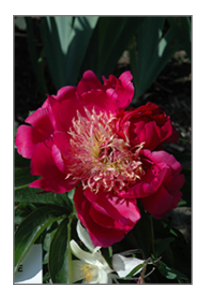
Comanche Peony flowers