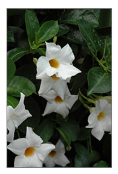
Summer Romance Bush White Mandevilla flowers

This variety produces beautiful white trumpet flowers from spring until fall, on a bushy, mounded habit; perfect for containers and baskets; great for full sun gardens