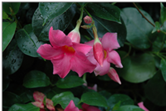
Summer Romance Bush Pink Mandevilla flowers

This plant does best in full sun to partial shade. It requires an evenly moist well-drained soil for optimal growth. It is not particular as to soil type or pH. It is highly tolerant of urban pollution and will even thrive in inner city environments. This particular variety is an interspecific hybrid, and parts of it are known to be toxic to humans and animals, so care should be exercised in planting it around children and pets. It can be propagated by cuttings; however, as a cultivated variety, be aware that it may be subject to certain restrictions or prohibitions on propagation.