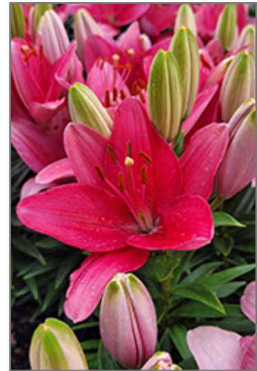
Lily Looks Tiny Toons Lily flowers