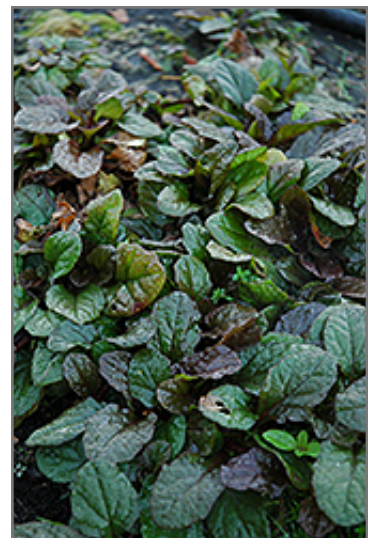
Bronze Beauty Bugleweed foliage