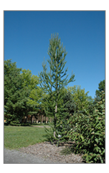
Jacobsen's Pyramid Japanese Larch

Jacobsen's Pyramid Japanese Larch is primarily valued in the landscape for its rigidly columnar form. It has rich green deciduous foliage which emerges light green in spring. The needle-like leaves turn an outstanding gold in the fall. The rough brick red bark is extremely showy and adds significant winter interest.