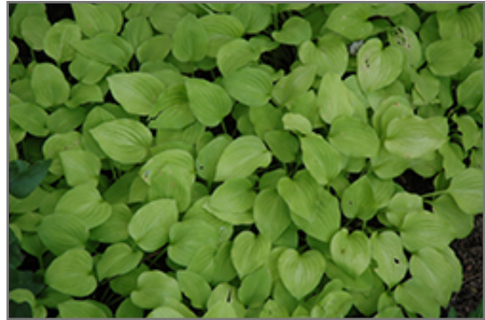
Sea Fire Hosta foliage