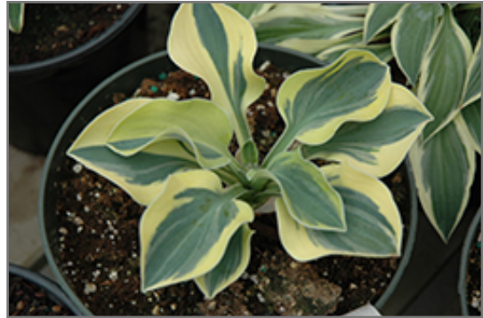
Lucky Mouse Hosta foliage