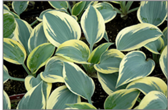
Ben Vernooji Hosta foliage

Ben Vernooji Hosta is recommended for the following landscape applications;