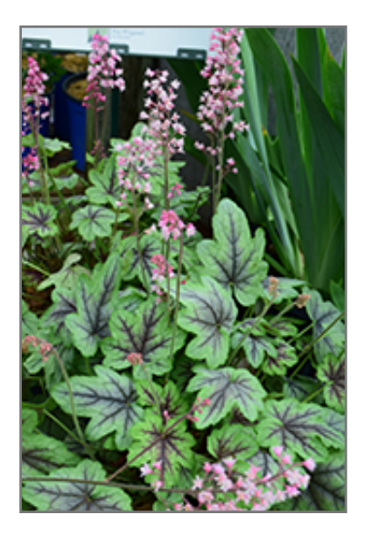
Pink Fizz Foamy Bells in bloom

Pink Fizz Foamy Bells is recommended for the following landscape applications;