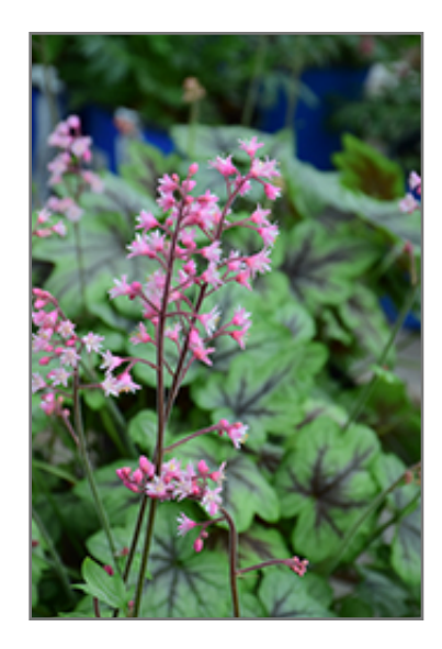
Pink Fizz Foamy Bells flowers