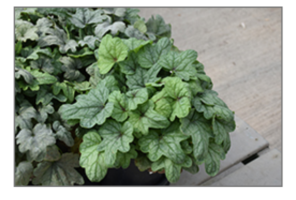
Pink Fizz Foamy Bells foliage

Pink Fizz Foamy Bells will grow to be about 8 inches tall at maturity extending to 12 inches tall with the flowers, with a spread of 18 inches. When grown in masses or used as a bedding plant, individual plants should be spaced approximately 15 inches apart. Its foliage tends to remain low and dense right to the ground. It grows at a medium rate, and under ideal conditions can be expected to live for approximately 10 years. As an evegreen perennial, this plant will typically keep its form and foliage year-round.