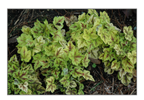
Leapfrog Foamy Bells

Leapfrog Foamy Bells is recommended for the following landscape applications;