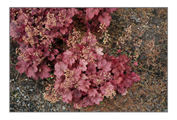
Root Beer Coral Bells in bloom

Root Beer Coral Bells will grow to be about 7 inches tall at maturity extending to 18 inches tall with the flowers, with a spread of 14 inches. When grown in masses or used as a bedding plant, individual plants should be spaced approximately 12 inches apart. Its foliage tends to remain low and dense right to the ground. It grows at a medium rate, and under ideal conditions can be expected to live for approximately 10 years. As an evegreen perennial, this plant will typically keep its form and foliage year-round.