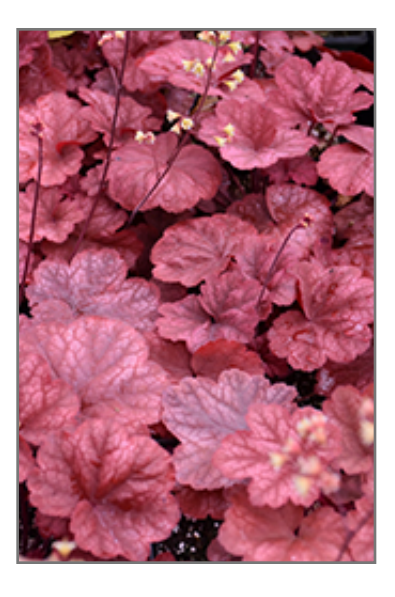
Root Beer Coral Bells foliage

This is a relatively low maintenance plant, and should be cut back in late fall in preparation for winter. It is a good choice for attracting hummingbirds to your yard. It has no significant negative characteristics.