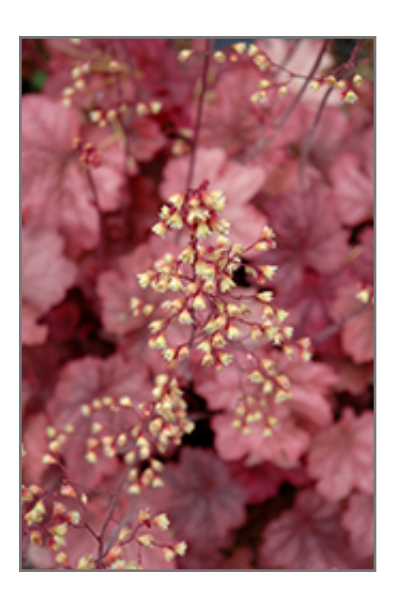
Root Beer Coral Bells flowers